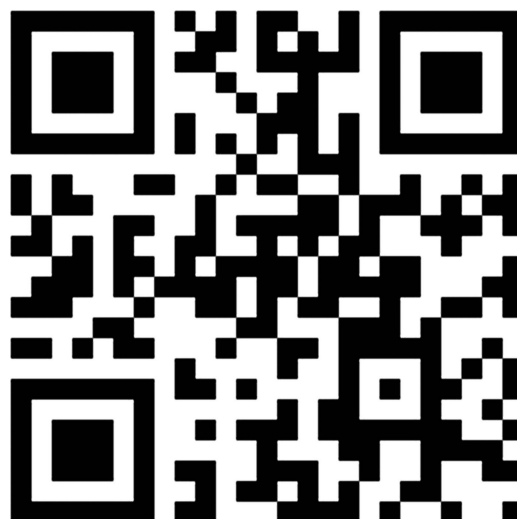
Figure 5 QR code. Scan to view video on 3D printing.

There are many potential uses for 3D printing in medicine, including ophthalmology, which could have a significant impact in changing the ways patients are treated for various conditions in the future. A number of recent reviews have been published and include 3D printing and culture of cells, blood vessels and vascular networks, 4 bandages, 5 bones, 6 ears, 7 exoskeletons, 8 windpipes, 9 dental prosthetics including a jaw bone, 10 and future corneas 11 entirely new organs to treat specified diseases such as diabetes, creating prosthetics that look like the body part they are replacing or supporting, stem cells, testing of new drugs using printed tissues, and customised drugs.