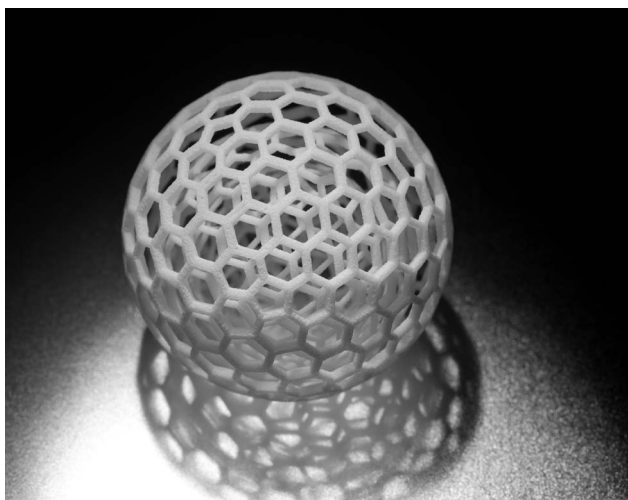
Figure 3 Multiple series of spheres 3D printed inside each other.

in 3D printing, the cost of the set-up is minimal which allows for a high degree of customisation, as the cost of the first item is the same as the last. Hence, 3D printing is ideal for making one of a kind items at cost-effective prices. For example, it may be possible using this technique to rapidly screen new potential therapeutic drugs on 3D printed patient tissue, greatly cutting production costs and time.