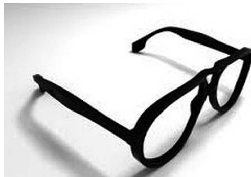
Figure 1 3D printed eye glass frames.

In the early 1980s Charles Hull invented 3D printing 2 which he described as stereolithography (STL) or the 'printing' of successive layers of material on top of each other to create a 3D object. The STL may specify information about the object to be printed such as its colour, texture, layer thickness, etc. A large number of such files are available commercially. To demonstrate this new technology, STL files were used to 'print' a pair of conventional eyeglass frames (figure 1), an unconventional multicoloured statue consisting of a variety of shapes, angles, curves and intricate details in one layer