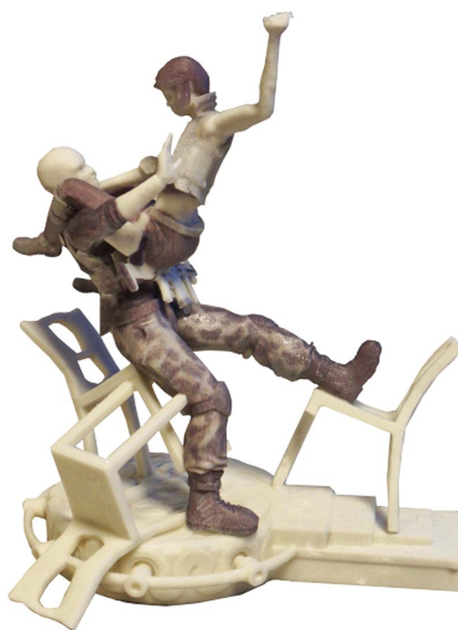
Figure 2 Complex multicolored 3D printed sculpture.

Another feature of 3D printing involves economies of scale. While traditional manufacturing methods are still cheaper for large scale production, the cost of 3D printing is becoming competitive for smaller production runs. NASA just produced a fuel injector for one of their rockets at a third of the cost and two-thirds of the time compared with traditional methods and plans to have a 3D printer on board in their next space flight. 3 Furthermore,